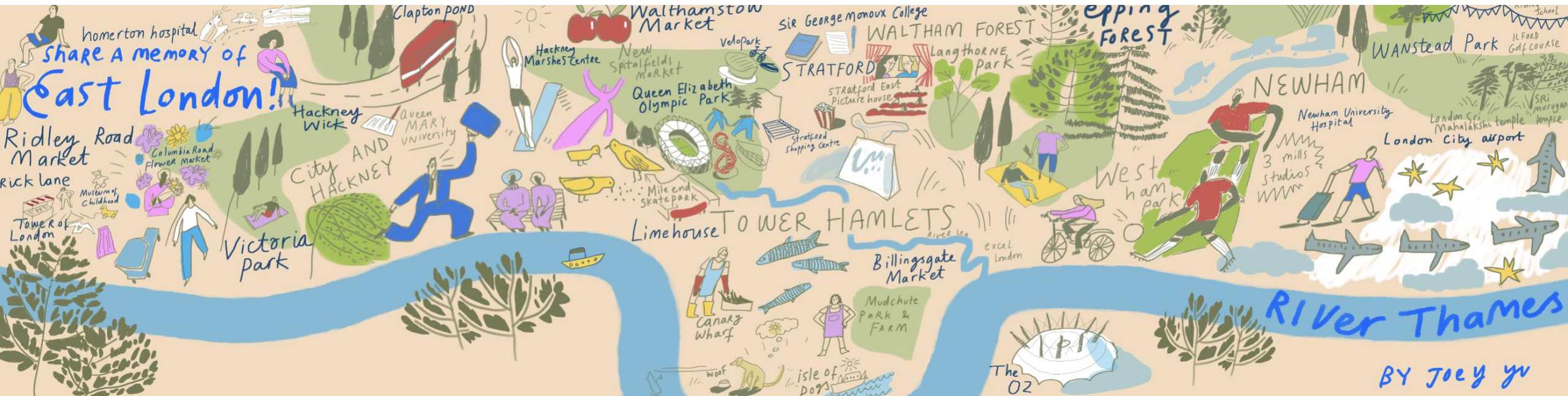
Map produced as part of STEP collaborative group project, commissioned by Great Get Together, 2019

Wellbeing Support Regular contact with dedicated Programme Officer plus group sessions with trained therapist